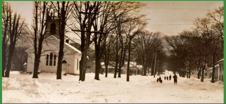
Winter in East Dorset Village circa 1940's

Phone: 802-362-4571 Fax: 802-362-5156 Email: townmanager@gmail.com Website: www.dorsetvt.org