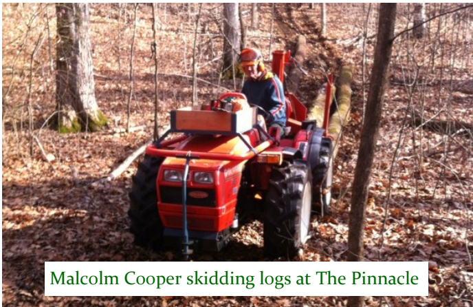
Malcolm Cooper skidding logs at The Pinnacle