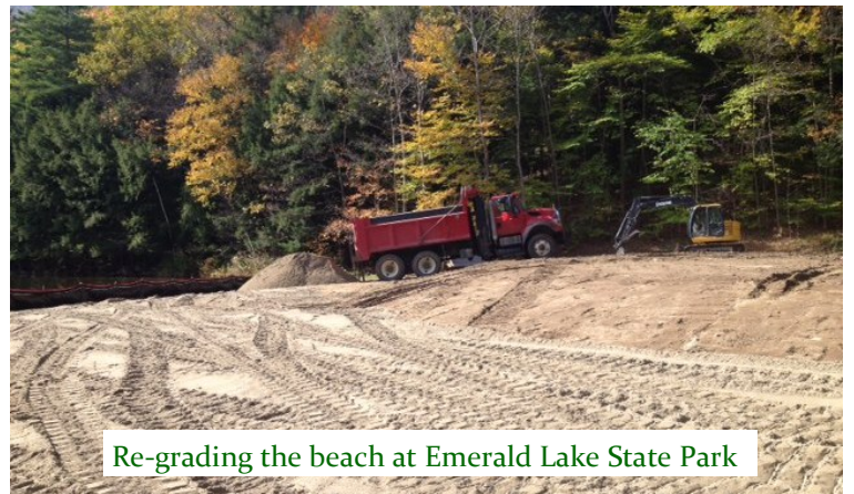
Re-grading the beach at Emerald Lake State Park

We want your pictures! Throughout the year we'll be taking pictures to include in the 2012 Town Report, we invite residents to submit pictures to be included in the report & on the town website.