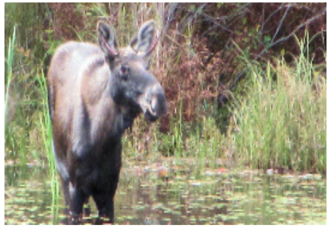
Young male moose in East Dorset